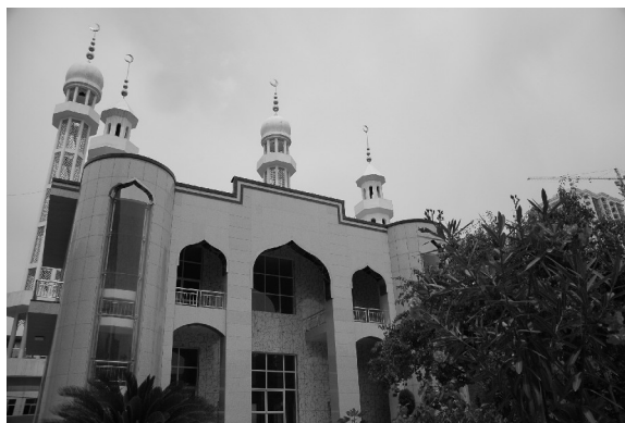
Photo 2 Baishu Xiang Mosque