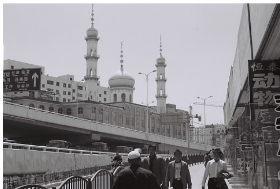
Photo 1 Walking south from the West Bus Station

Option 2: Look out for the tall, green minaret of Xiaoxihu Mosque (小西湖清真大寺 Xiǎoxīhú Qíngzhēn Dàsì) on the main road, which runs east-west along the south edge of Xiaoxihu Park (小西湖公园 Xiǎo Xī Hú Gōngyuán). Head south through Baishu Xiang Alley (柏树巷 Bǎishù Xiàng, Lit. 'Cypress Alley'), past the impressive Baishu Xiang Mosque (柏树巷清真大寺 Bǎishù Xiàng Qíngzhēn Dàsì). After going through the railway underpass you can go left, right, or straight on. Use the map below, and aim for the railway level crossing .