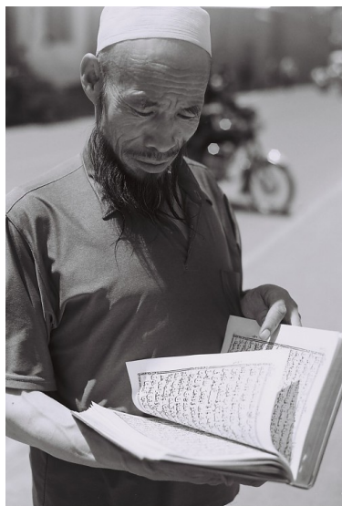
Photo 3 Reading the Qu'ran